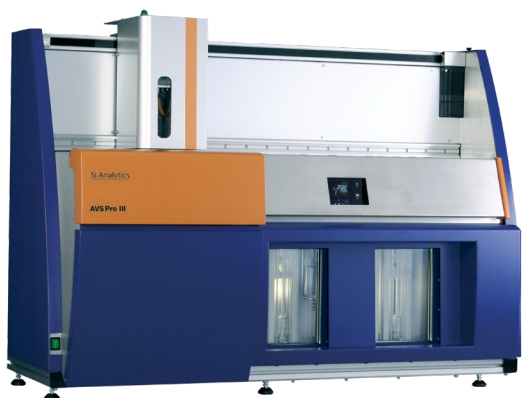
AVS® III - autosampling system

The waste system can differ depending on individual needs. The difference between the two systems lies in sample handling: The AVS® 370 uses manual filling while the AVS® Pro III includes an autosampler for fully automated measurement sequences.