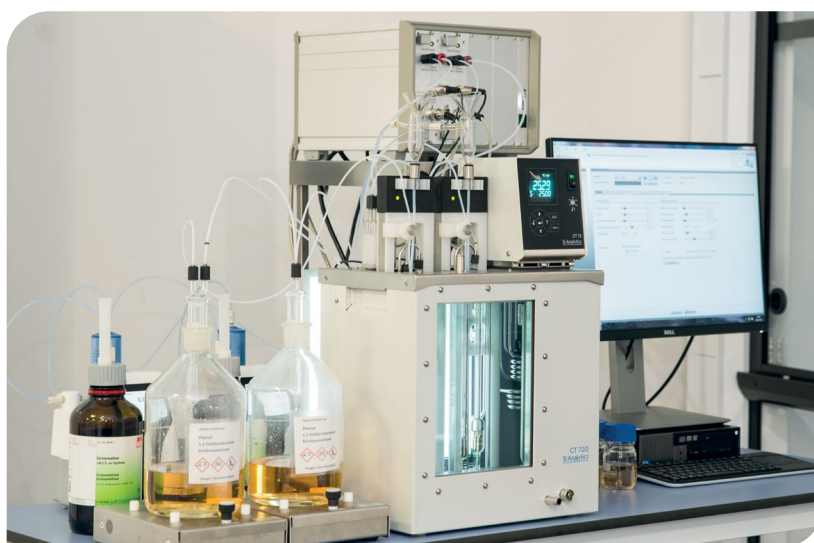
AVS® 370 - manual filling